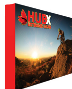
RPL 7.5ft Straight Pop Up Display