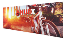
RPL 20ft Straight Pop Up Display