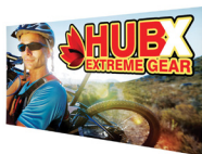
RPL 15ft Straight Pop Up Display