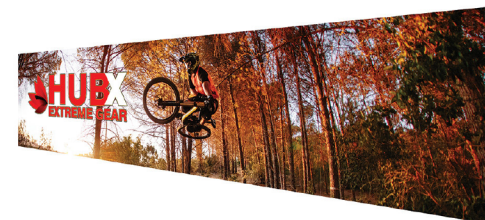
30' STRAIGHT POP UP DISPLAY