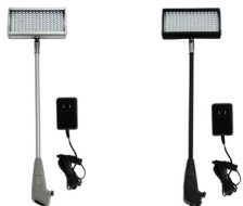
Ready Pop Lights (Silver or Black)