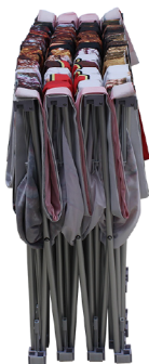
Frame / Graphic

Please remove all parts from the boxes and review them. Contact your service representative if there are any missing parts.